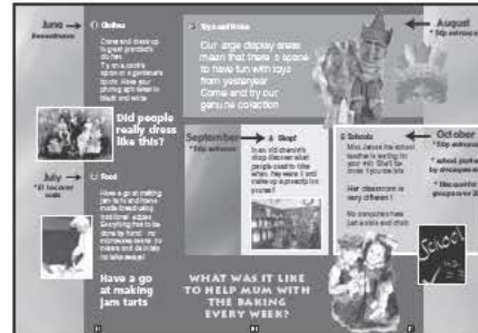
The Midhampton Museum leaflet